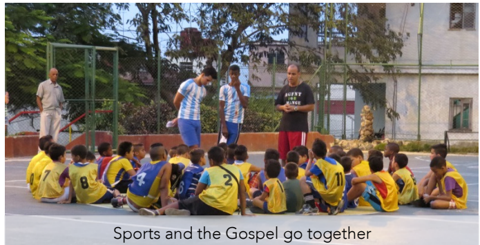
Sports and the Gospel go together