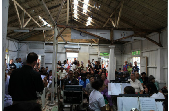
Church planting service in La Perla