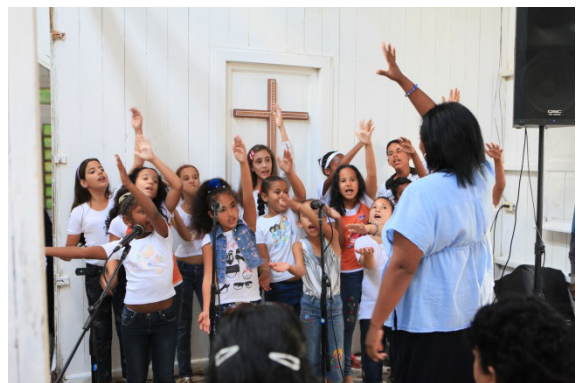
Children from the Bible club in the church service