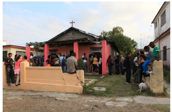
Many did not have a seat in the chapel