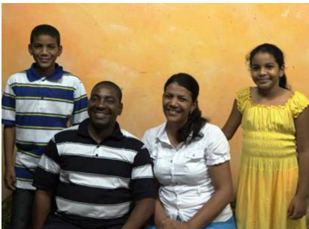
Family Rivero – Las Tunas