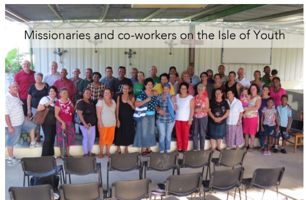
Missionaries and co-workers on the Isle of Youth