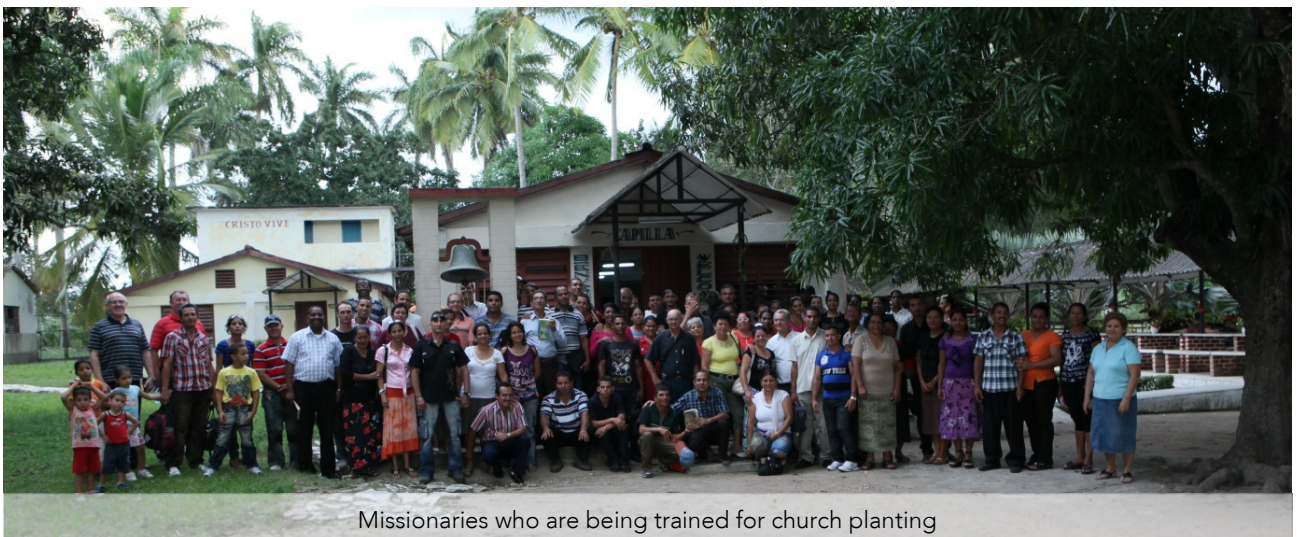
Missionaries who are being trained for church planting

On January 26, we travelled to Las Tunas. About 150 km before Las Tunas, in Céspedes, we had a meeting with a group of about 70 "missionaries" who were trained in evangelization and the planting of new churches. Some gave a testimony of God's working in the midst of big challenges. They told us about the people who found Jesus and about the new churches which had been planted. We could share some words from the Bible and encourage them for their missionary work. With great joy and the conviction that the support of this project is worth it, we went on.