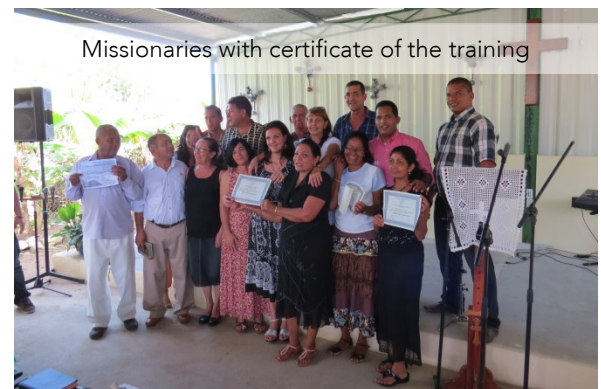
Missionaries with certificate of the training