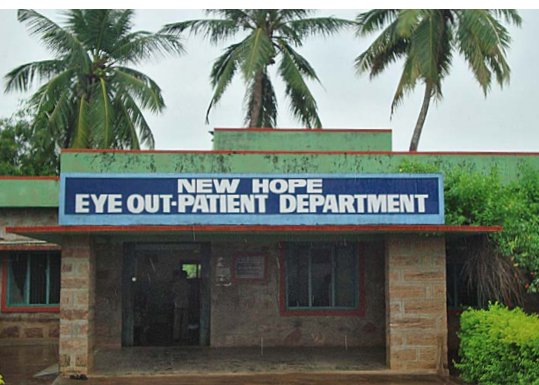
Entrance to the eye clinic

It is worth running and is essential to continue the Eye services at Pithapuram and to support this project. Most of the beneficiaries are from rural community, elderly people, some of them are neglected by their children in their old age, some of them are under privileged not able to go to corporate set ups and even private hospitals. Their visions are restored and able to survive on their own in the society.