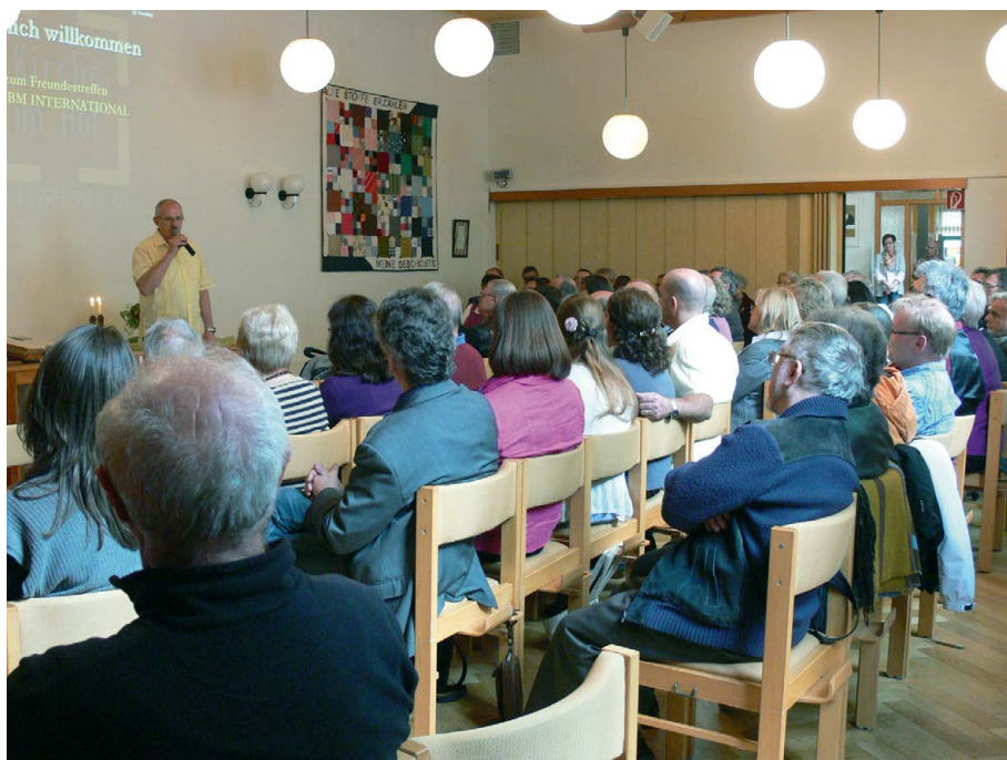
The EBM meeting of ambassadors- and friends in Kassel, Germany

We have realized that we have the common concern of motivating churches so that they should understand themselves as partaking in God's mission, supporting the various mission activities of EBM INTERNATIONAL by giving as well as praying. For this reason, we will be happy to present EBM INTERNATIONAL's work in churches. We, that is the mission secretaries in Elstal and a motley group of people who have missions at heart. The group includes people ranging from former missionaries, pastors, and mission tour guides to ordinary church members who share a common cause: They all have missions and EBM INTERNATIONAL at heart. During the first meeting, the ambassadors were provided some material: Besides flyers and short films they were also given a comprehensive presentation portraying the various projects of EBM INTERNATIONAL in Africa, Latin America, India, and Turkey.