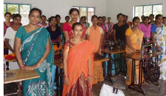
CREAM – Sewing school in Tallarevu

In the elementary and secondary school the children get the possibility of an education with the result that a lot of them escape the child labor. After graduation they have the possibility to finish a training in sewing, computer and electro-technics. In the sewing schools, f. ex., the students learn the sewing and tailoring within one year. After graduation they get a sewing machine (25 percent of the costs have to be taken by the students). With this machine they can earn money and help the elderly people with sewing their clothes. In the surrounding churches there are still five sewing schools. In the computer schools the students learn the handling with the computer. After graduation they have the possibility to find a job in public authorities or in private sectors like architects or doctors. The result is that the students get perspectives for their future especially in view of self-supply, independence and self-fulfillment. But our main concern is to reach the children and students with the love of Jesus-Christ with prayer and conversation so that they can get new