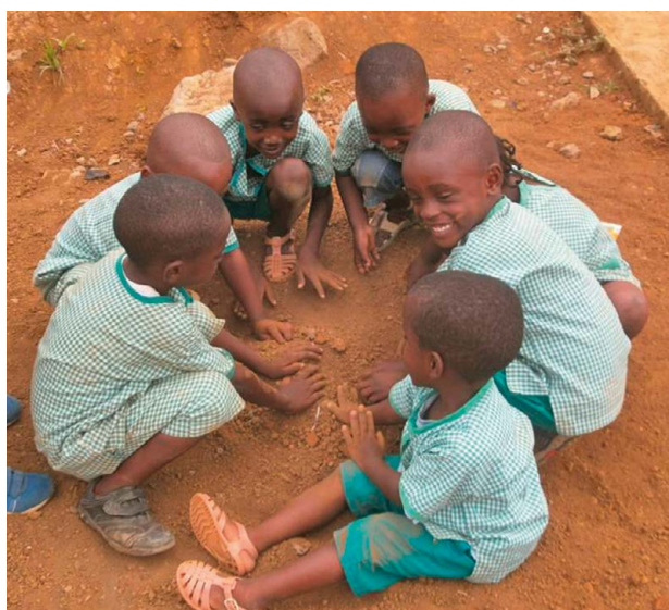
Pre-school sports programme

The second school, "El Buen Pastor – The Good Shepherd", has a pre-school, a primary and a secondary school. For the almost 100 children attending pre-school, we could set up a second room and can now teach them in parallel groups. Before, we had to teach reading and writing to the children in two groups, one in the morning and one in the afternoon. Playing with modelling clay is the favourite activity of the children – and the teachers as well: it is fantastic to see the shapes modelled from the clay as well as the laughter brought about on the children's faces.