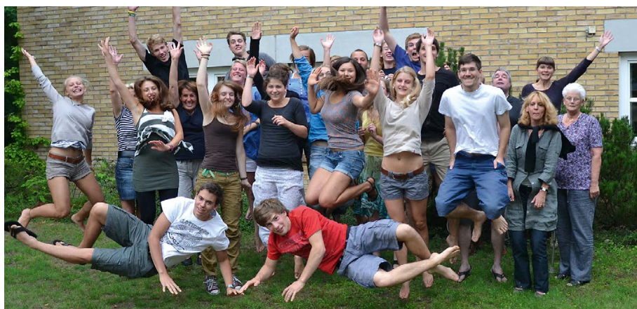
The volunteers 2012/13 in preparation

We have been given practical information on questions such as these: “How do I settle finances with EBM? How often do I have to write reports for “weltwärts’ ”, but we were also challenged to think about specific situations: “What would I do if ...; Who would I turn to in case of ... How will I handle a crisis situation?”