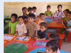
Pre-school children in Madhapur

Please specify the purpose for your donation. End-of-year donation receipts are sent out automatically. This is why we always ask for your full name and address and – if known – for your donor ID number. Should there be more donations than needed for any specific project, the excess money will be used for a similar project. One-off receipts are available on request only. Thank you for your understanding.