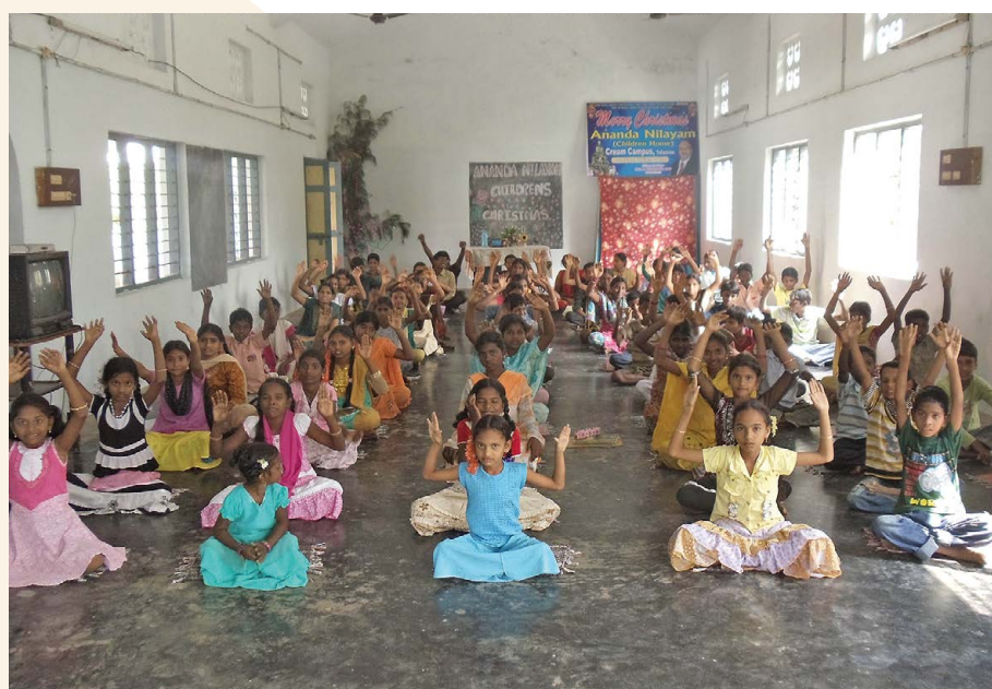
CREAM – Children of the Children's Home in Tallarevu