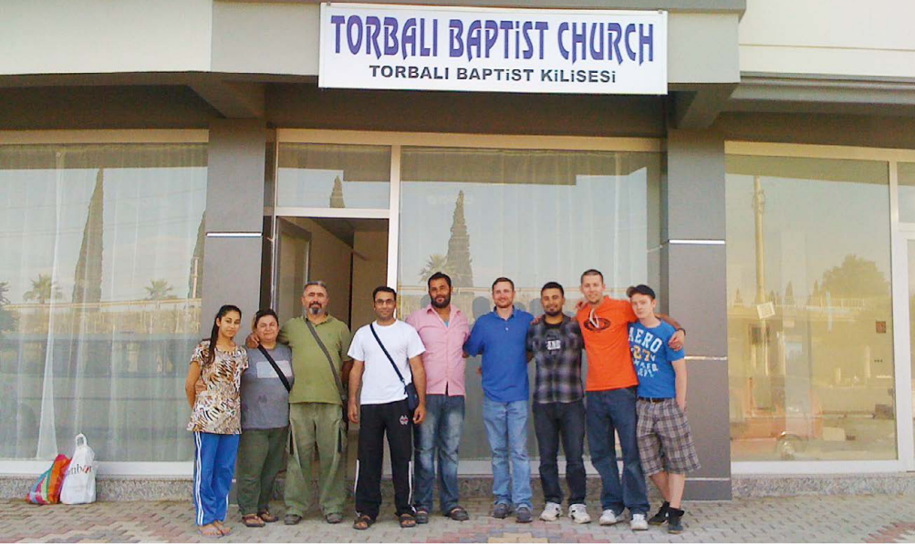
Some members of the Torbali Church