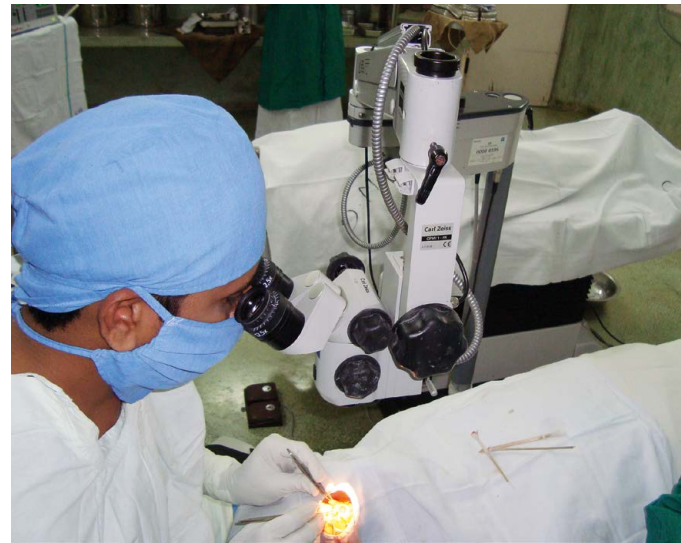
Cataract surgery at CMC, Pithapuram

Over these we have covered more than 300 villages twice or even more and covered entire district i.e. East Godavari. For the past 25 years 10,000 to 15,000 out patients are benefited every year and performed 1,200 to 1,800 IOL surgeries and got good vision. Through this services base hospital is also benefited and got good reputation.