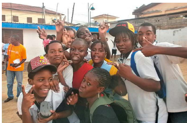
Kids at the secondary school in Malabo