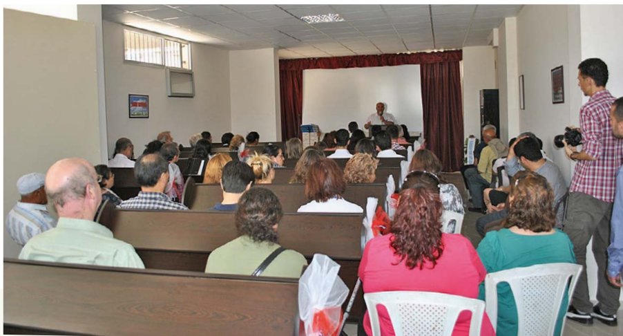
Worship in the Torbali Church