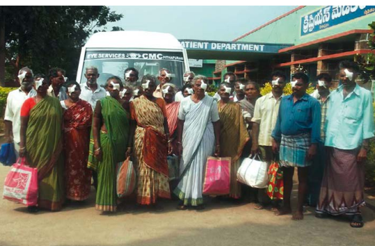
Patients of the eye clinic