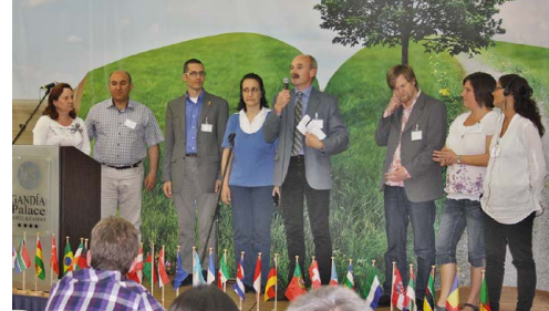
EBM INTERNATIONAL Mission Council 2012