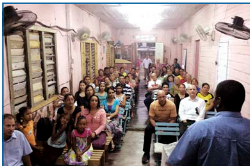
▲ Eastern Cuba

In Bahia Honda and in La Timba we celebrated the inauguration of the two new churches. Though most of the new brothers and sisters have been believers for less than two years they've already passed a little exam about the Bible, the teachings, and ethics. Those exams are very common when planting new baptist churches in Cuba. It is exciting to see how much these new believers already know about the Word of God and how much they appreciate it. As soon as the group in Bahia Honda grows bigger they want to start new mission works in other areas of their region.