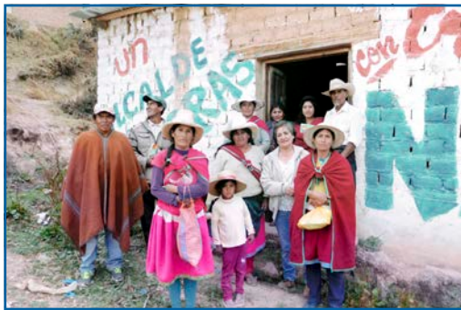
▲ Sisters and brothers in Rayán

All of Peru is being affected by strong rains. Flooding rivers, mudflows, and mudslides are complicating or making the visits of our missionaries into the villages almost impossible.