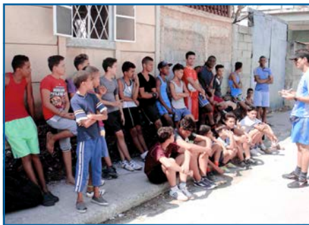
▲ Sports program