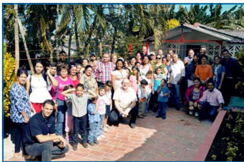
▲ Bahia Honda

The missionaries in Cuba are doing their work joyfully and with confidence even though they have difficult tasks and lots of challenges.