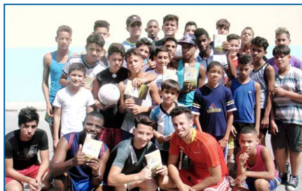
▲ Soccer team

Since I've committed my life to Christ my life has changed completely. I hardly ever argue with my parents. I have many friends. I hardly lie nor do I make fun of other people. Now I help wherever I can.