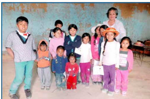
▲ Children in Rayán