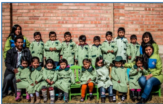
▲ PEPE-Kinder in Bolivien

In San Rafael, in the district of „Poor devil,“ a new PEPE project should be started; but that has not worked; a building could not be found. But in the quarter „Rosengasse“ everything was perfect as to the conditions for